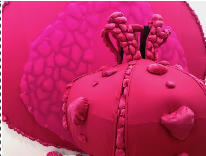
LACE at ALAC.

2020 MFA ART THESIS EXHIBITIONS USC ROSKI School of Art & Design