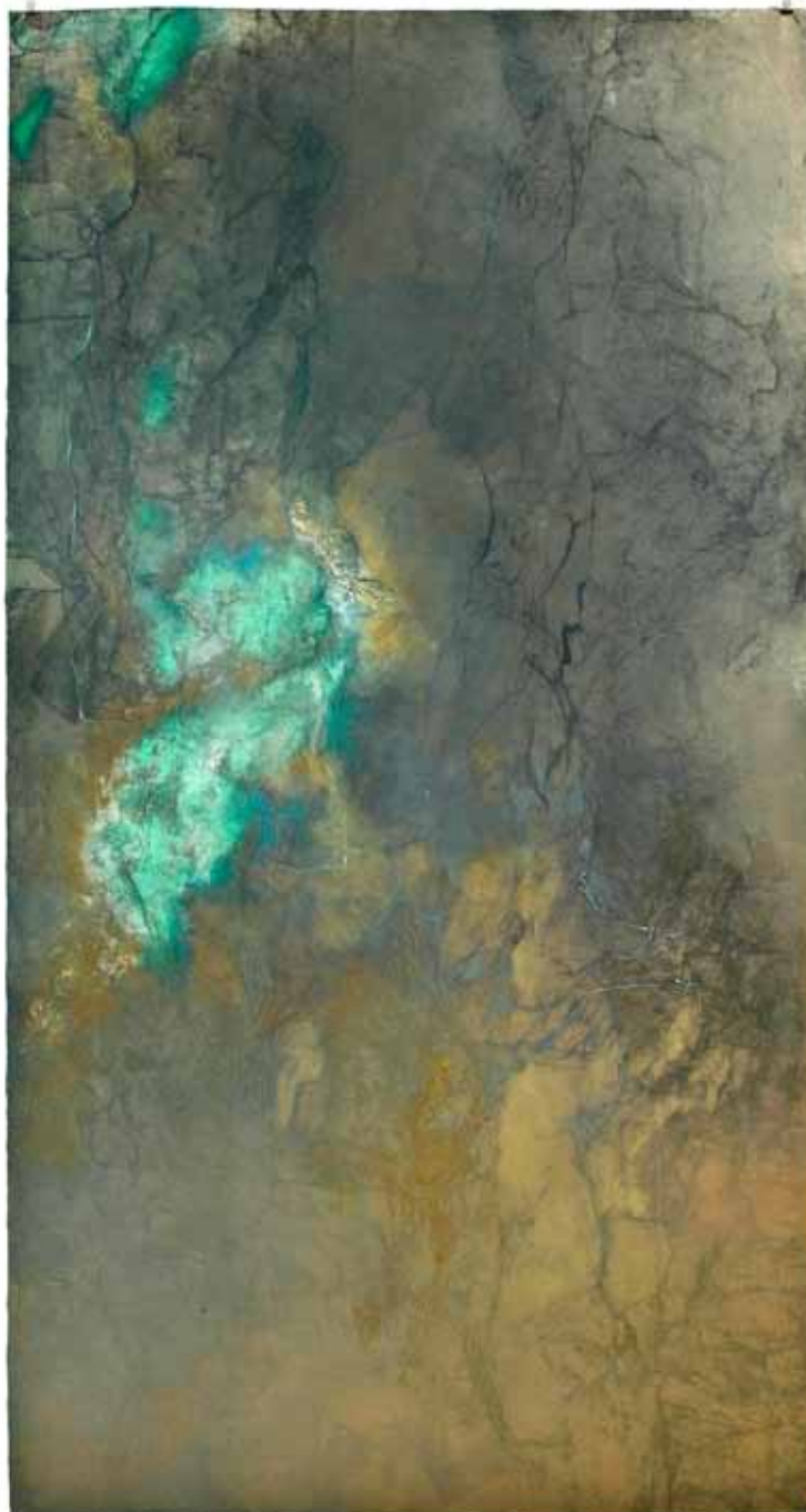
Formations - Aqua Minor, 2009, mixed media, mixed process on paper, 66" x 36".