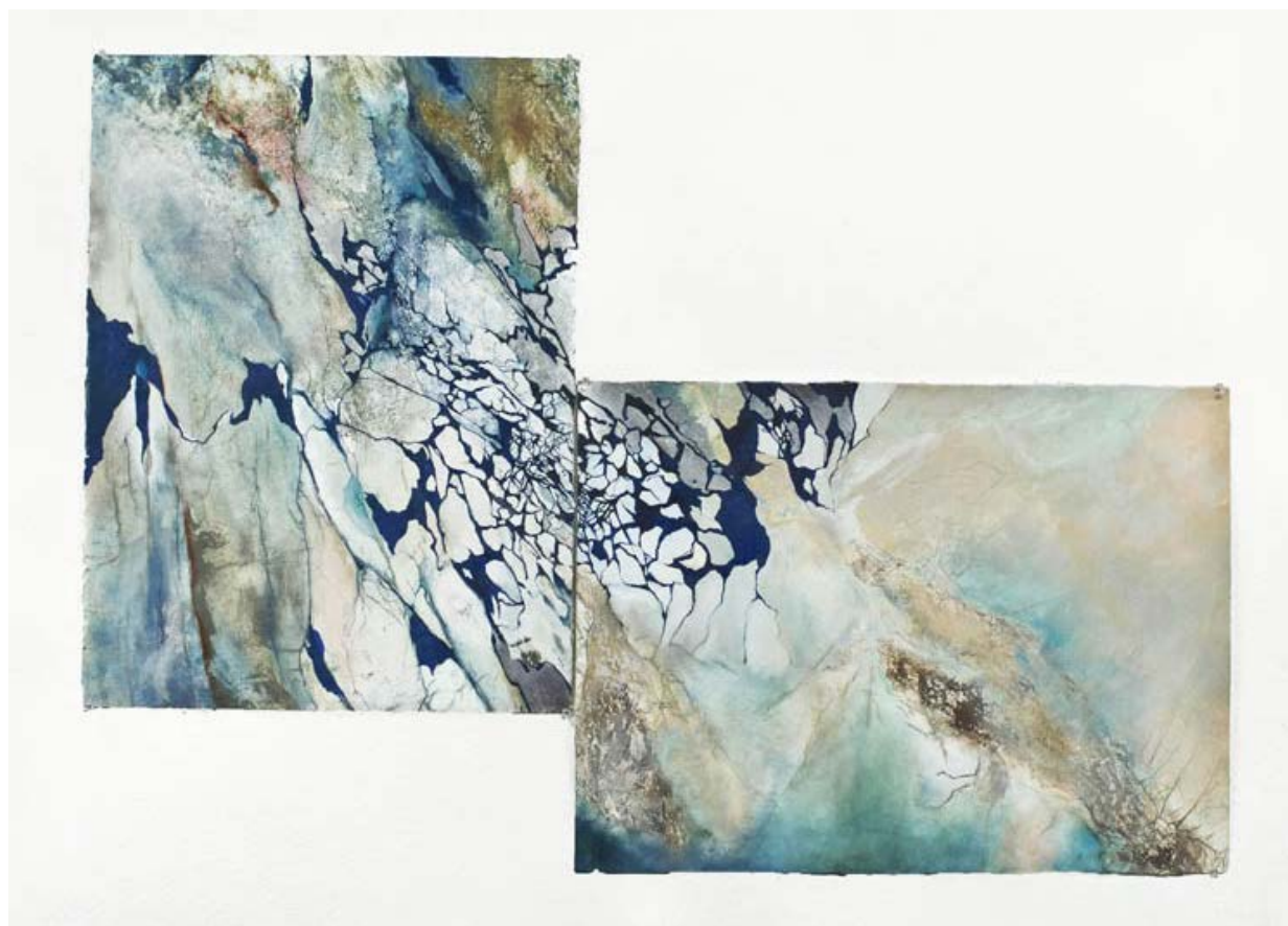
Virginia Katz, Formations - White Melt - White Freeze , 2010