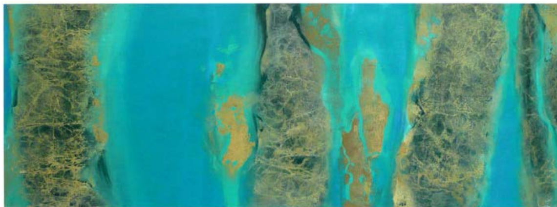
Virginia Katz Path - Swell, 2010

Her recent exhibit Charted Territories at Ruth Bachofner Gallery, included 10 mixed media and five oil paintings from a series of nonrepresentational works inspired by satellite and aerial images, some of which were made using a complex procedure combining two different printmaking processes -- monoprint and collagraph. She glues crinkled up foil on a plate and drips colored inks on it, before running the shallow reliefs through a press. As soon as the print dries, Katz then uses her colored pencils, pastels, gouaches and dry pigments and starts drawing and painting terrains, creases, cracks and vapor. Other than in her Formation Series , in Path 2010 , created during Katz's residency at the School of Visual Arts in New York, the artist also integrated leaves, vines, bark and local water. The work is a combination of mixed media and oil on paper with a dominant area in a solid turquoise, broken up with small areas in gold and medium size areas in brown-greenish hues.