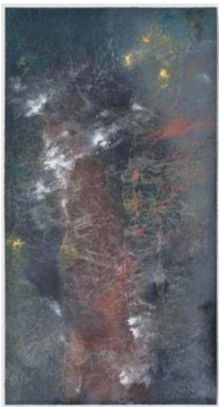
Virginia Katz, "Formations – Red and Grey Dust Cloud," mixed media, mixed process on paper on panel, 66" x 36".

Katz's keen observations of the natural world, coupled with her inimitable expression of it through her art, give viewers a lot to think about. Indeed, each work in "Chartered Territories" provides a provocative view of the mysteries of Mother Nature.